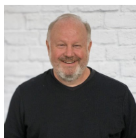
Minister of Music & Senior Adults